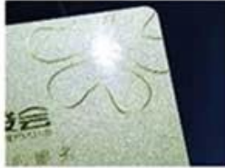
golden Hot Stamping