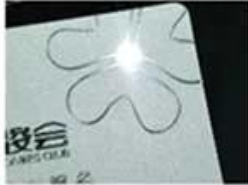
Silver Hot Stamping