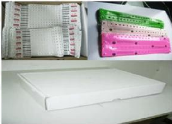
Package for Soft PVC/ Paper Wristbands