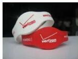
4.Silicone Wristbands (Full Sealed Type)