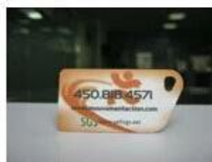
7. NFC PVC Tags