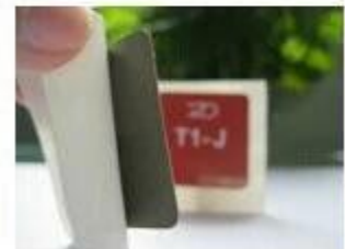
8. Anti-metal Stickers