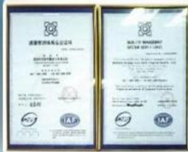
ISO9001:2000 Quality Management System