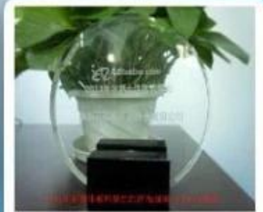
Outstanding and Honorable E- Businessman Award by Alibaba in 2011