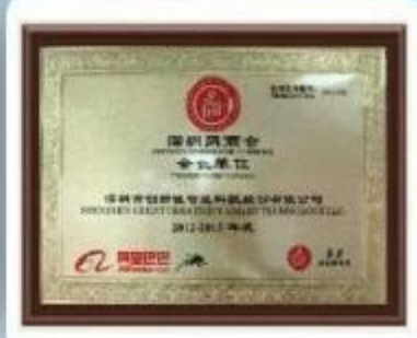
President Member Company of Shenzhen Chamber of E-Commerce