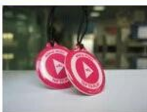
2.NFC Epoxy Tags