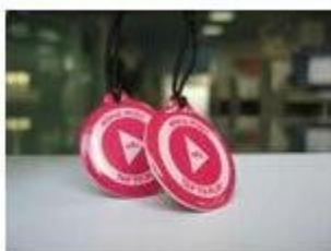
2.NFC Epoxy Tags