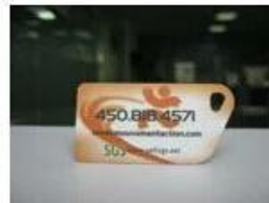
7. NFC PVC Tags