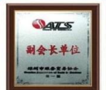
Vice President Company of Shenzhen Association of Trading in Services