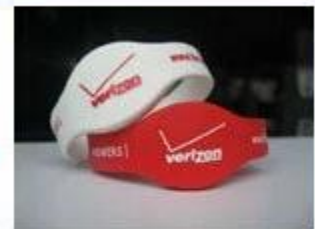
4.Silicone Wristbands (Full Sealed Type)