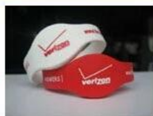
4.Silicone Wristbands (Full Sealed Type)