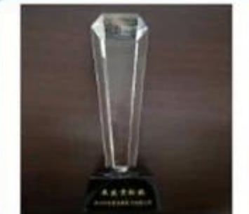
Outstanding and Honorable EBusinessman Award by Alibaba in 2010