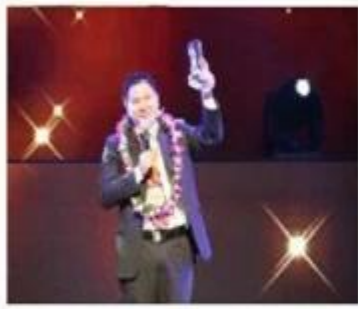
Top 10 Global Netentrepreneurs Award