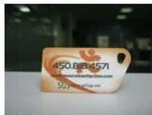
7. NFC PVC Tags