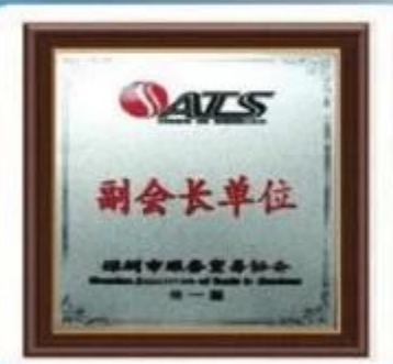
Vice President Company of Shenzhen Association of Trading in Services