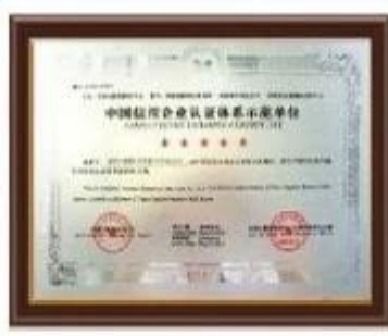
China Credit Example Certificate