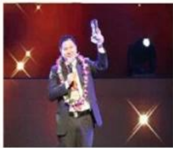
Top 10 Global Netentrepreneurs Award