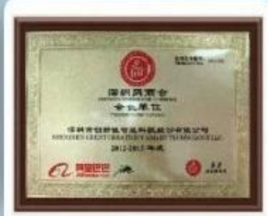
President Member Company of Shenzhen Chamber of E-Commerce