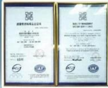
ISO9001:2000 Quality Management System