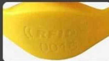
Laser UID number