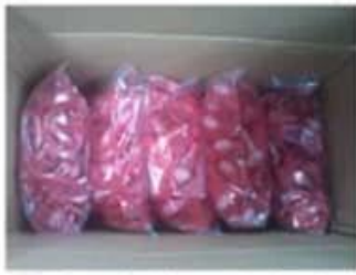
Package for Silicone Wristbands