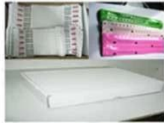
Package for Soft PVC/Paper Wristbands