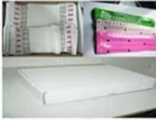
Package for Soft PVC/Paper Wristbands