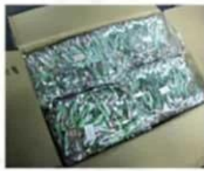
Package for Woven Wristbands