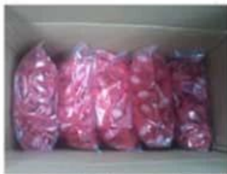
Package for Silicone Wristbands