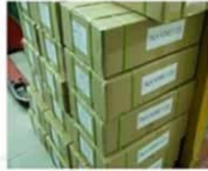
Outside Carton Package