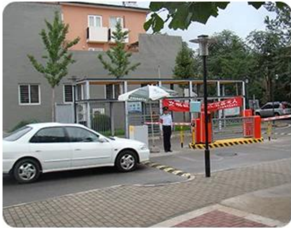
Parking Vehicle management