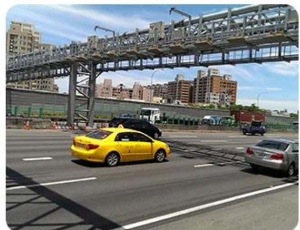
Vehicle toll collection management