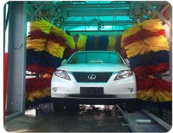
Car wash vehicle access control management