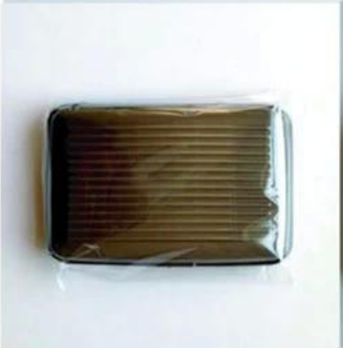
Normal opp bag