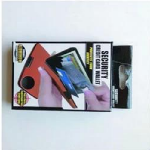
Custom printed box