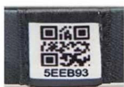
Unique QR code and number