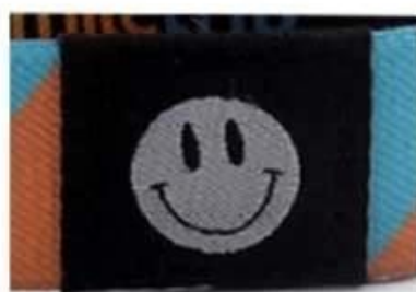
Panton woven logo