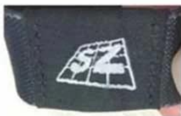
Two sides stitch