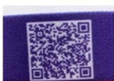
Unique QR code on band