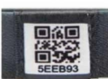
Unique QR code and number