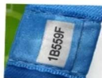
Unique serial number