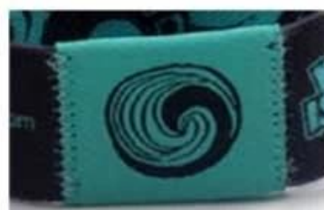
Z sides stitch