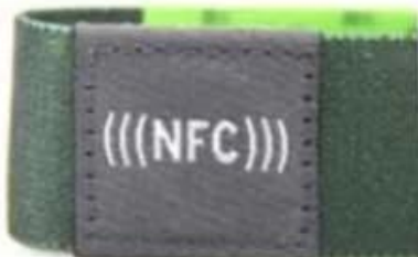
Four sides stitch