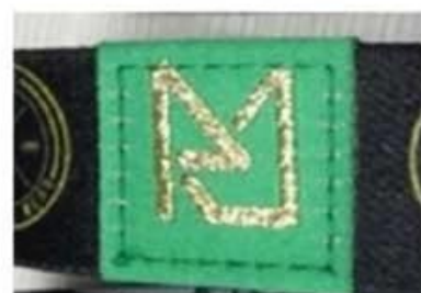
Gold woven logo