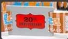
4C custom LOGO printing