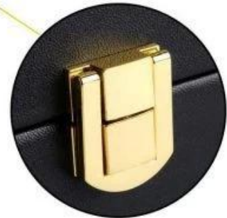
Strong Metal Buckle