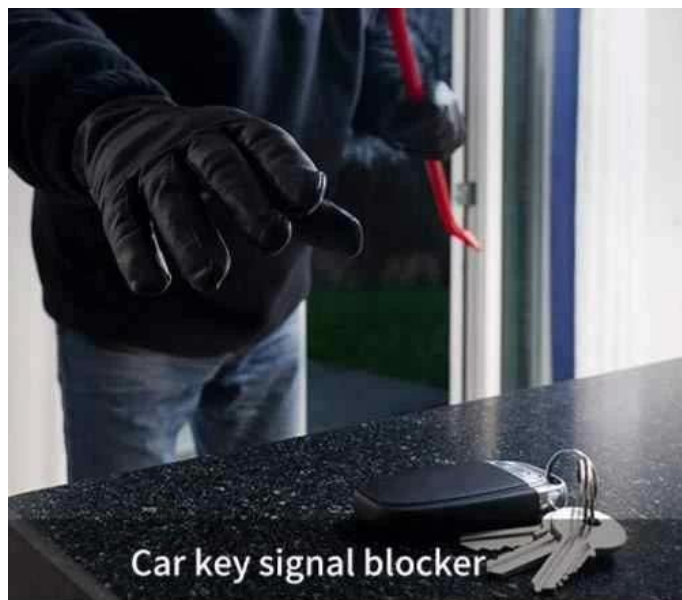
Car key signal blocker