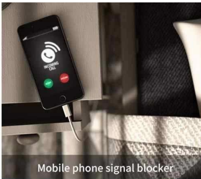
Mobile phone signal blocker