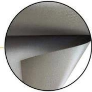
High Density Faraday Fabric