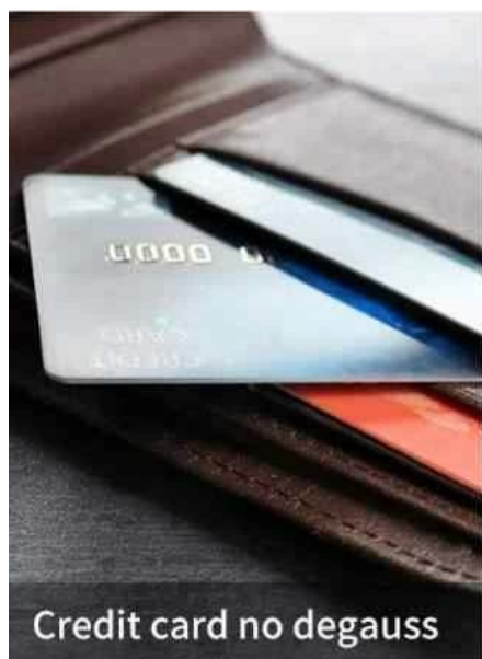
Credit card no degauss