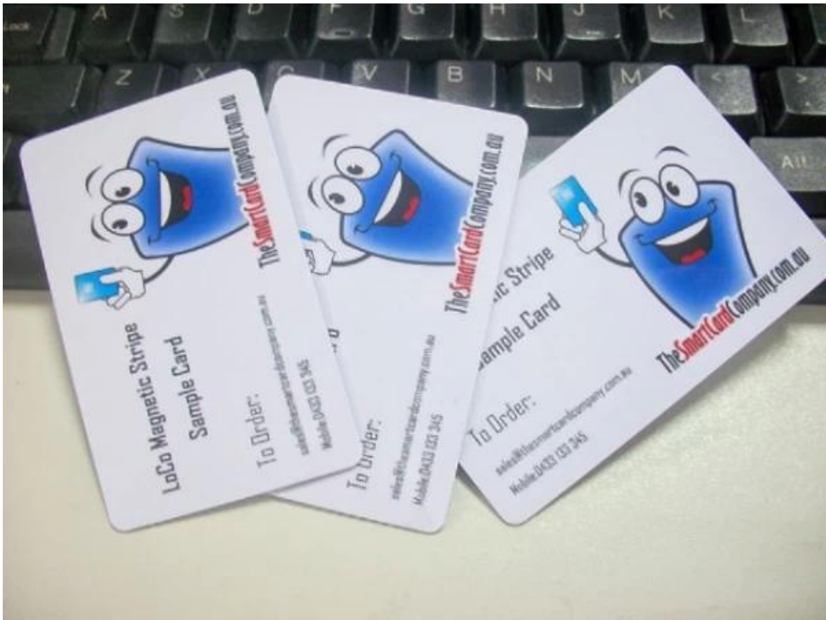
Other Products of Our Company