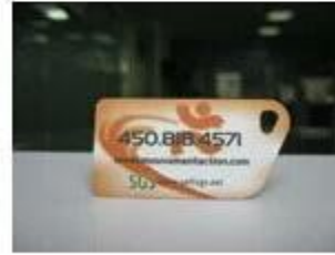
7. NFC PVC Tags