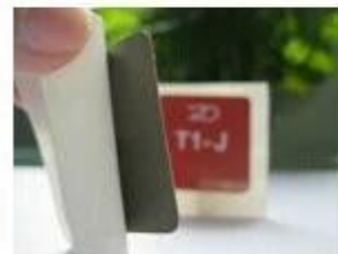
8. Anti-metal Stickers