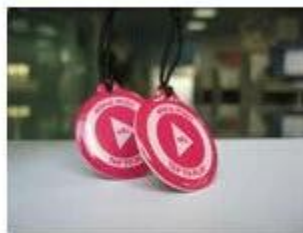
2.NFC Epoxy Tags