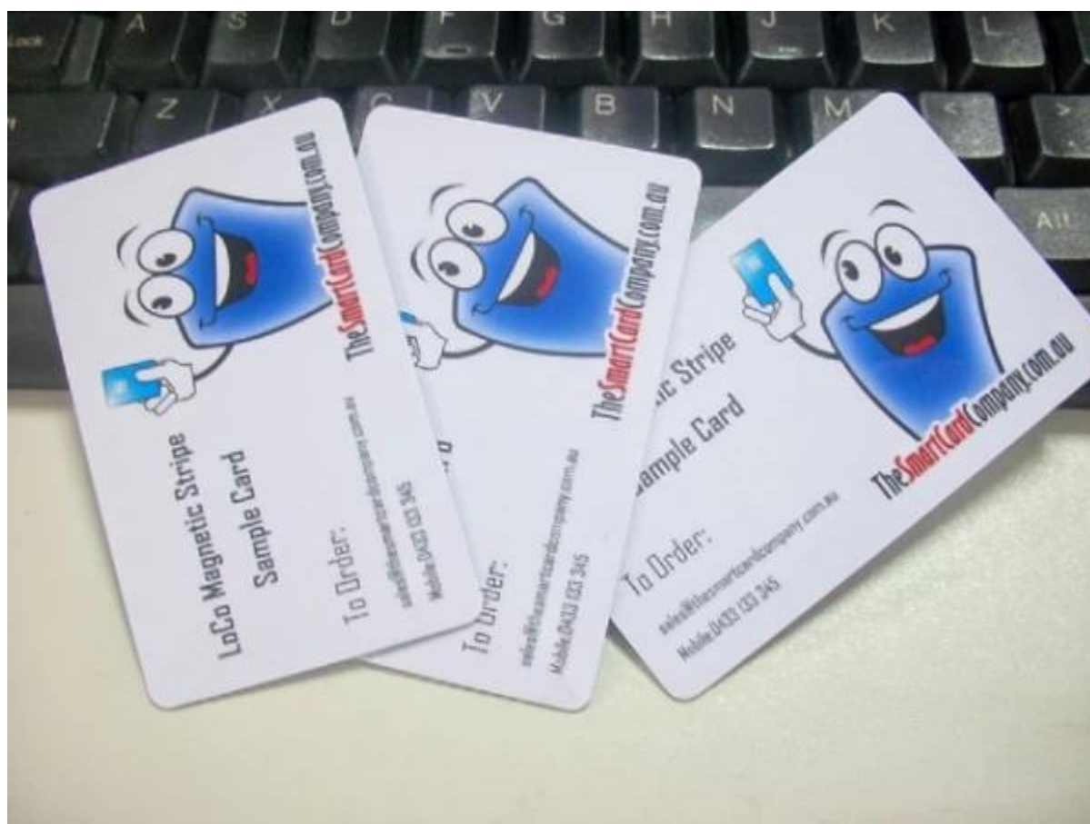
Other Products of Our Company