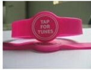
3.Silicone Wristbands (Adjustable Type )