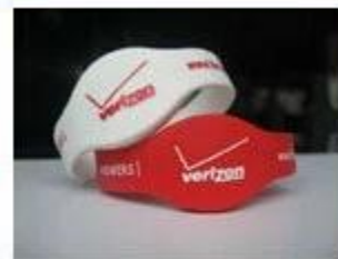
4.Silicone Wristbands (Full Sealed Type)