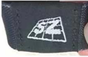
Two sides stitch