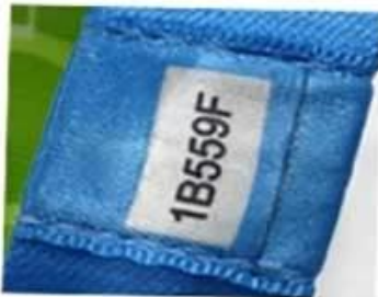
Unique serial number