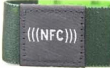
Four sides stitch