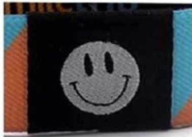
Panton woven logo