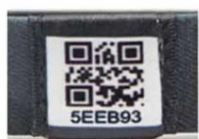
Unique QR code and number

If you want to know more or want to custom Elastic RFID wristband products, please feel free to contact us: info@nfctagfactory.com