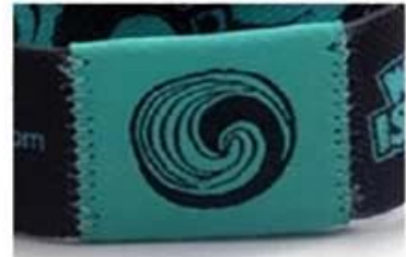
Z sides stitch