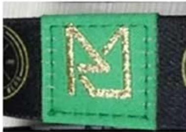
Gold woven logo