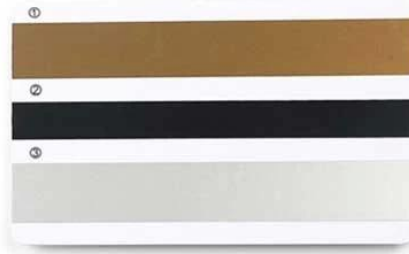
D. ①Gold Magnetic Stripe ②Black narrow Magnetic Stripe ③Silver Magnetic Stripe