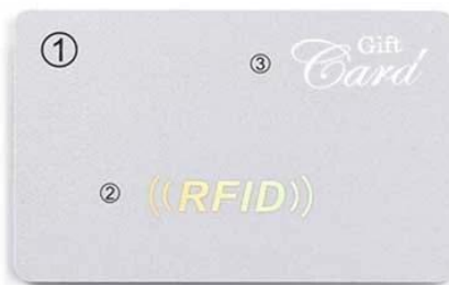
B. ①Silver Color ②Laser Silver Stamping ③Silver hot Stamping