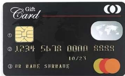
E. ①4428 Chip ②Large Convex Code ③Small Convex Code