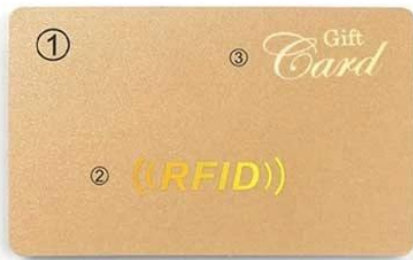
A. ①Gold Color ②Laser Gold Stamping ③Gold hot Stamping