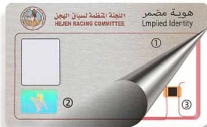
H. ①Pearlescent Color ②Anti-fake label ③RFID Chip