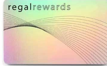
J. Laser Material