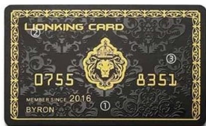
K. ①Matt finish ②Gold drawbench ③UV vanish