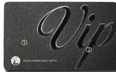
L. ①Frosted finish ②Metal Label