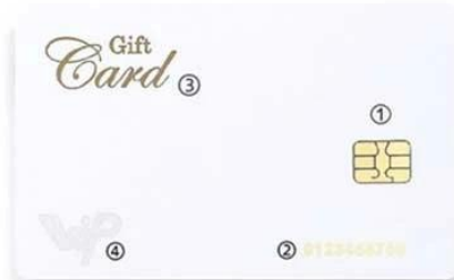
F. ①4442 Chip ②Gold Flat Code ③Gold Silk Screening ④Silver Silk Screening