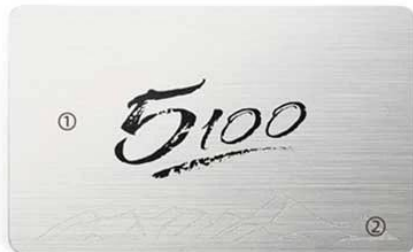
G. ①Silver drawbench ②Frosted UV