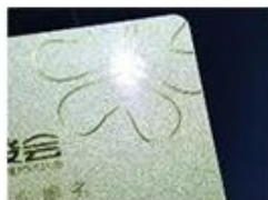
golden Hot Stamping