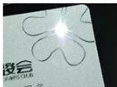
Silver Hot Stamping