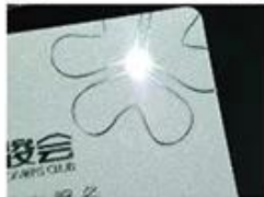
Silver Hot Stamping