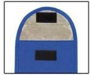
Conductive RFID Shielding Material