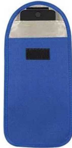
*Phone Not Included