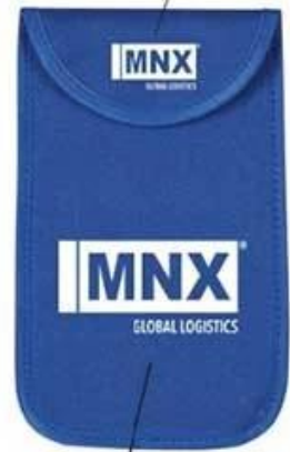
Optional Imprint Back