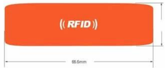
NFC Silicone Wristband Detailed Images: