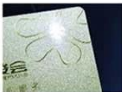
golden Hot Stamping