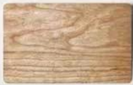
Red cherry wood