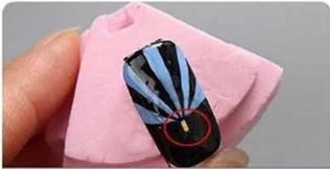
Step7 Semi- finish without decoration.