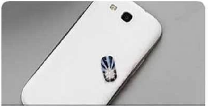
Step10 Approach NFC device,the led light up and blink.