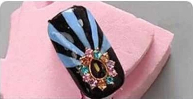
Step9 It's finish,it's easy.