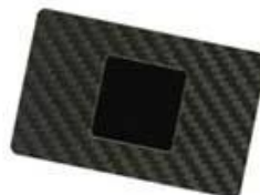
Carbon Fiber Card