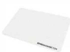
White PVC Card