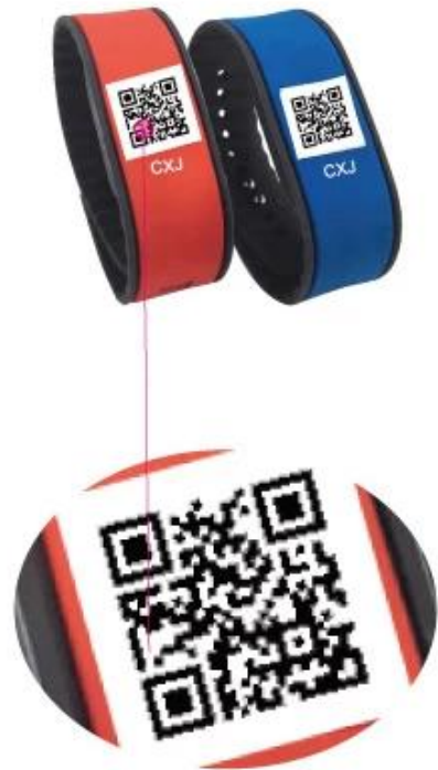
Union / Variable QR code