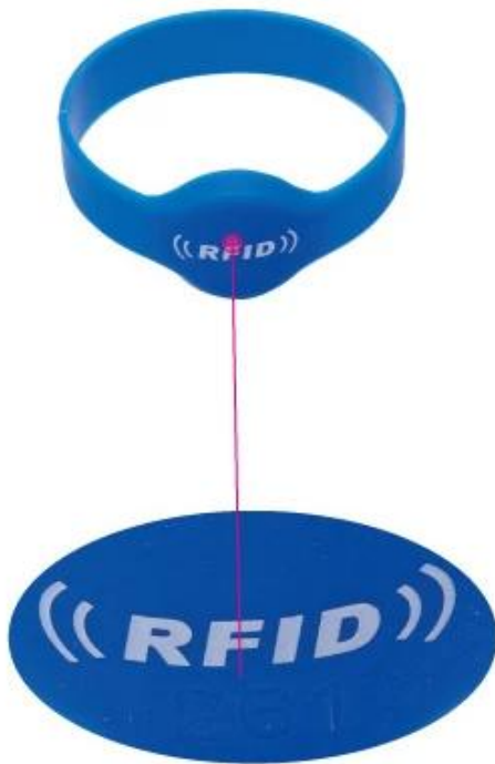
Pantone Color Print Laser with/without color