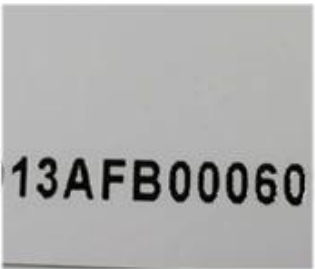
【 DOD Numbering 】