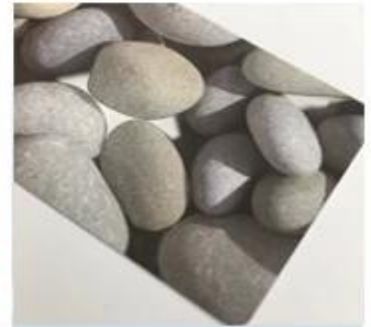
【 Special UV Oil 】