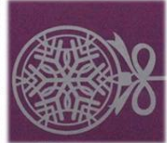
【Metallic Sliver 】