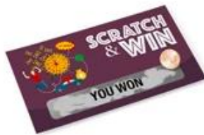
【Scratch off panel】