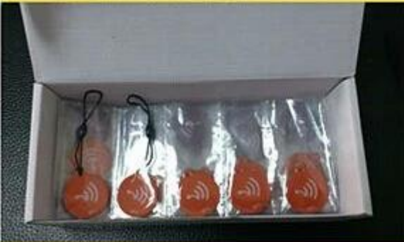
Package for Tags