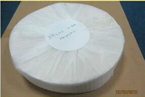
Stickers in Roll