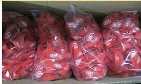
Package for Wristbands