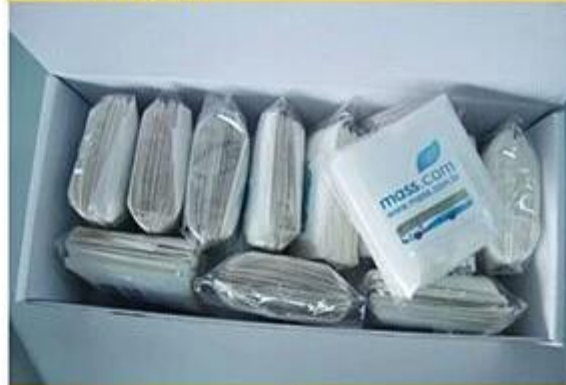
Stickers in Pieces