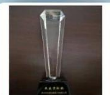
Outstanding and Honorable EBusinessman Award by Alibaba in 2010