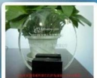
Outstanding and Honorable E- Businessman Award by Alibaba in 2011

Shenzhen Chuangxinjia smart card co.,Ltd offers RFID wristbands in a variety of materials, such as silicone, woven (cloth), and plastic, paper etc. We can customize them to include your logo and we have a various range of color offerings. We have RFID wristbands for point of sale, keyless hotel rooms, access control & security, counterfeit prevention, customer loyalty programs, and waterproof environments. Our goal is to help design a securely-sealed wristband that can reliably store and transfer data.