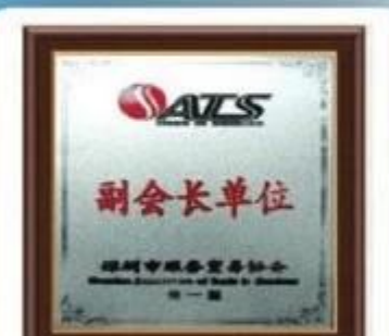
Vice President Company of Shenzhen Association of Trading in Services