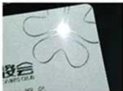
Silver Hot Stamping