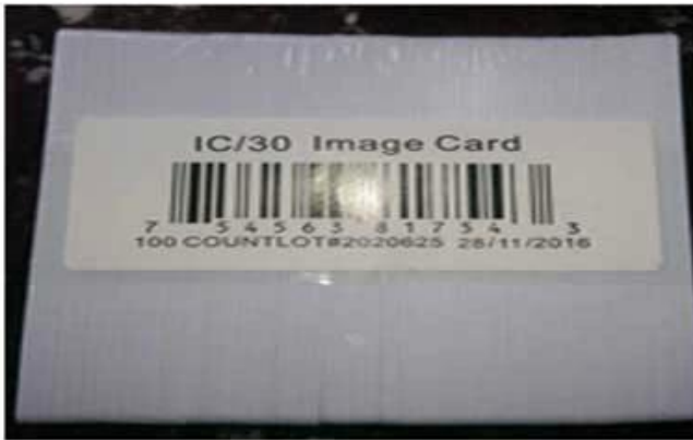
1. Hot Shrinkable film