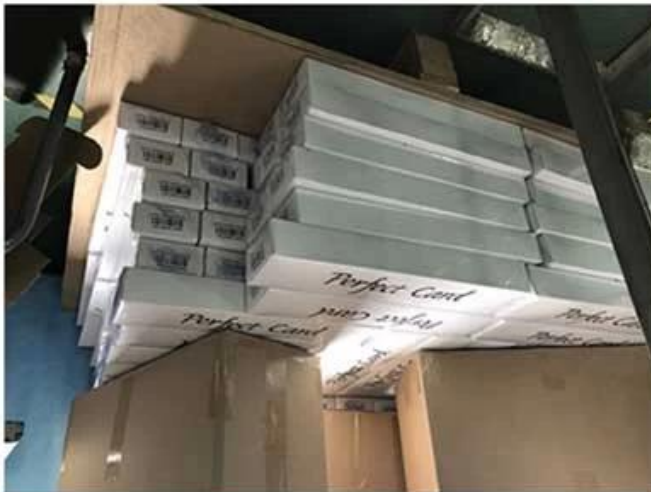
3. Outer Carton with High Quality