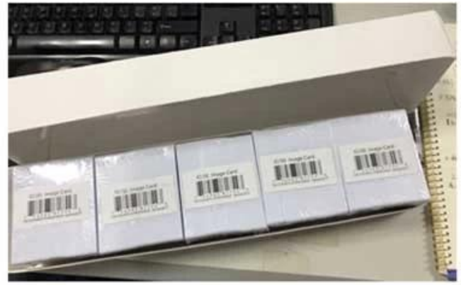
2. White Box