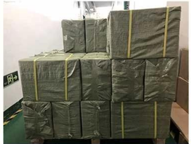
4. Customized Outer Package