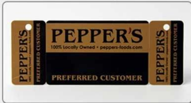
3. Comb card-style three