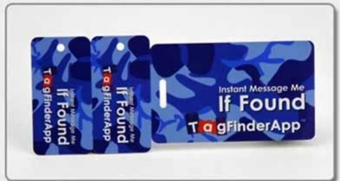
4. Comb card-style four