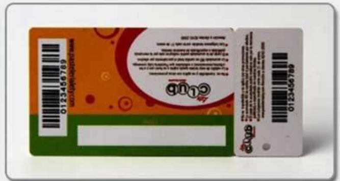
2. Comb card-style two