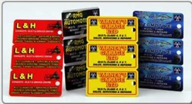
1. Comb card-style one