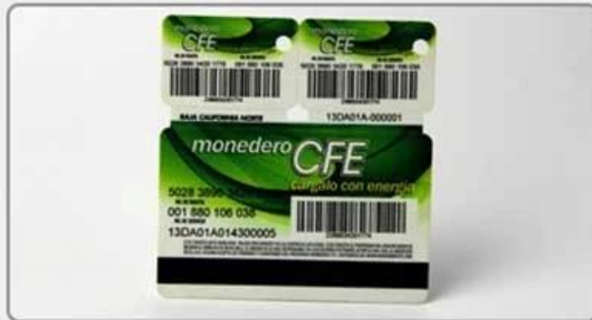
5. Comb card-style five