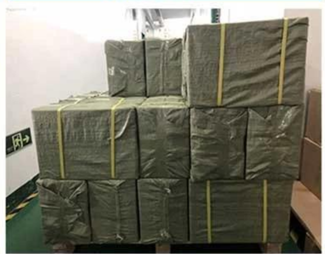
4. Customized Ourter Package