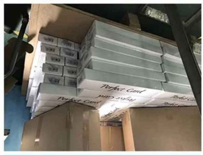
3. Outer Carton with High Quality