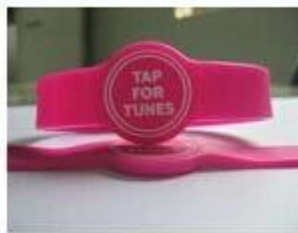
3.Silicone Wristbands (Adjustable Type )