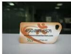
7. NFC PVC Tags