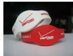
4.Silicone Wristbands (Full Sealed Type)