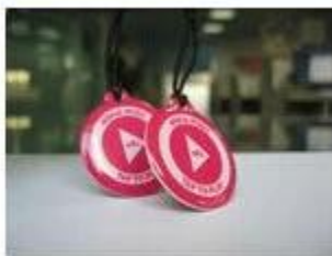
2.NFC Epoxy Tags