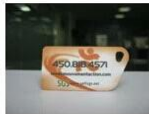
7. NFC PVC Tags