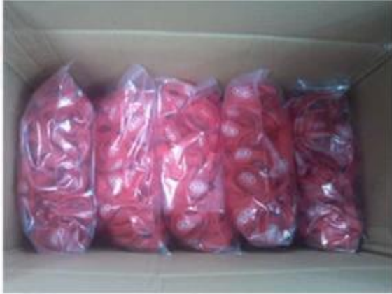
Package for Silicone Wristbands