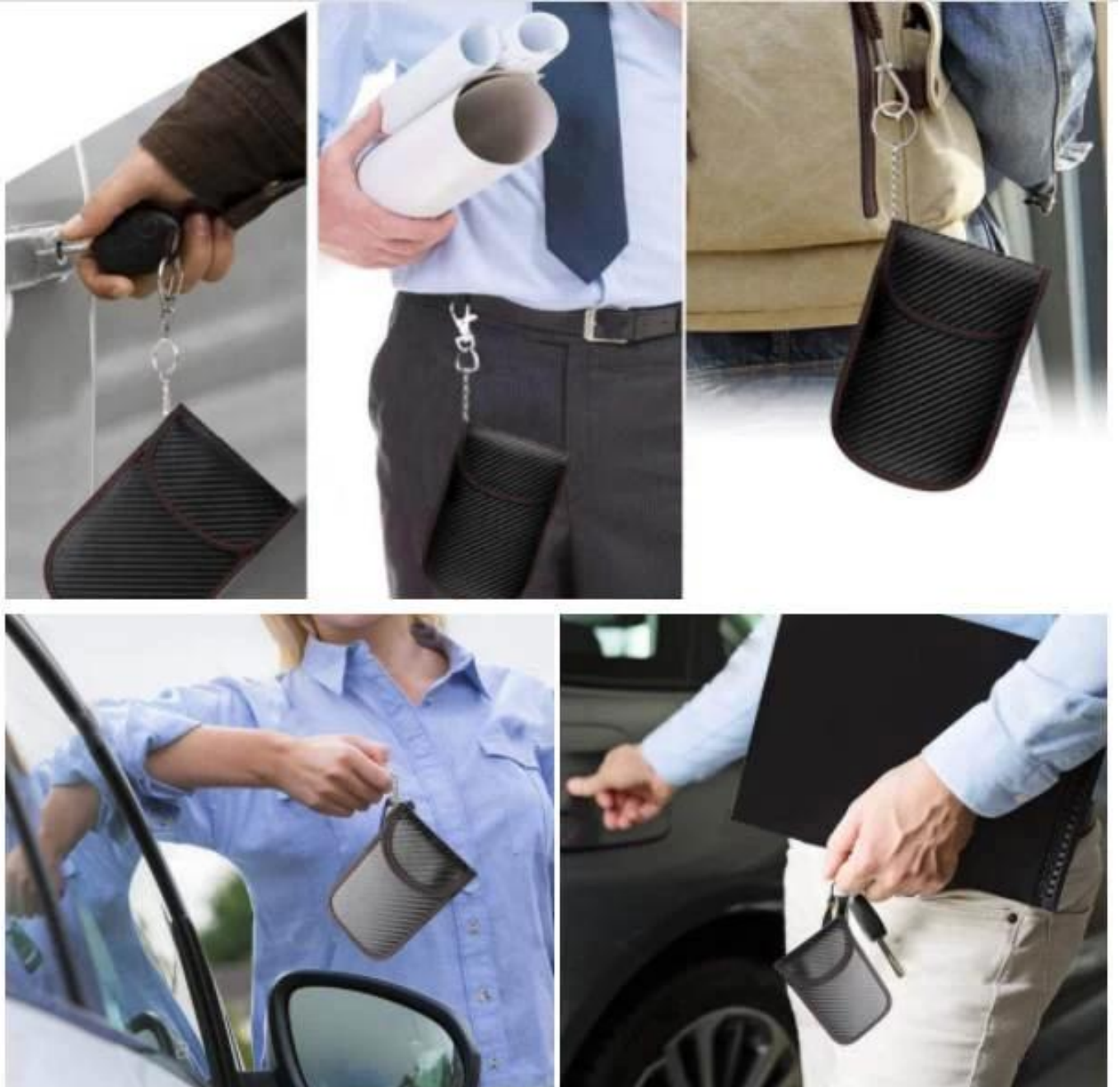
RFID Signal Blocking Bag Detailed Image: