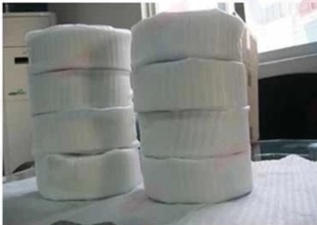
Protect with Bubble Pack