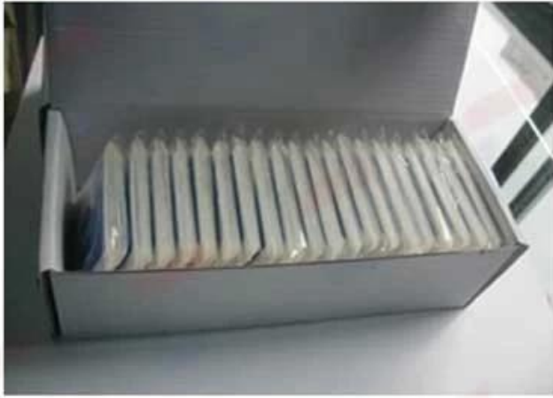
Packed By Pieces with OPP Bags