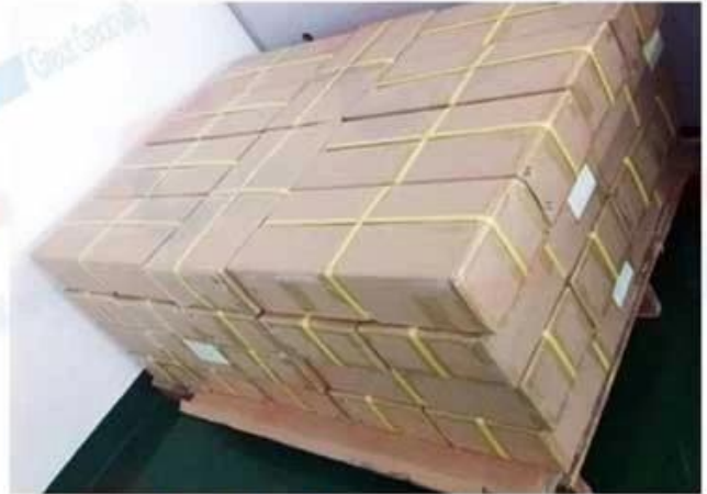
Outside Carton Package