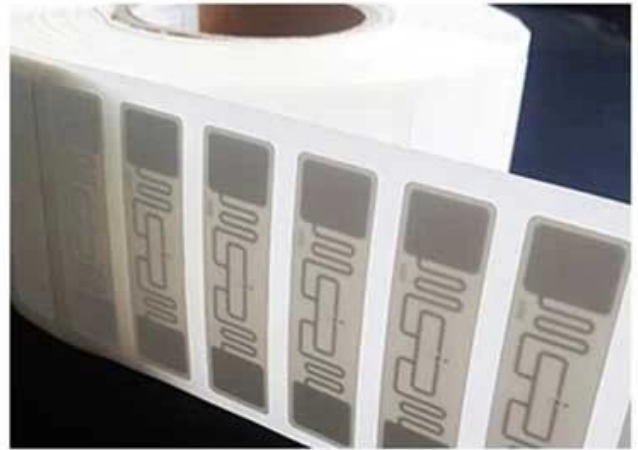
Packed By Roll