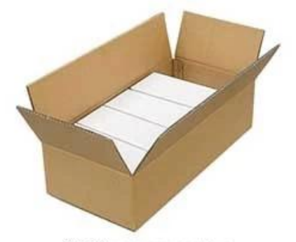
2000 pcs per carton