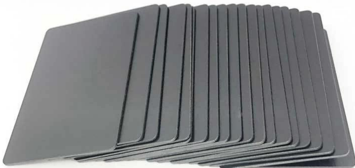
NFC Black Wooden Card