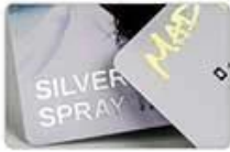
Gold/Silver Hot Stamp