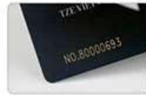
Laser Engraving Number