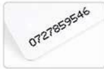
UID Inkjet Number