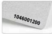
Thermal Transfer Number