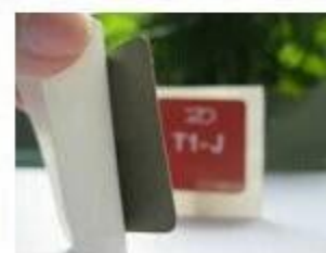
8. Anti-metal Stickers

Shenzhen Chuangxinjia smart card co.,Ltd offers RFID wristbands in a variety of materials, such as silicone, woven (cloth), and plastic, paper etc. We can customize them to include