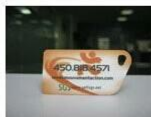
7. NFC PVC Tags