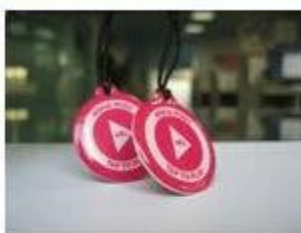
2.NFC Epoxy Tags