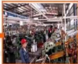
7. Fabric strip producing