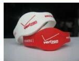
4.Silicone Wristbands (Full Sealed Type)