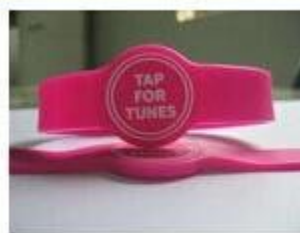
3.Silicone Wristbands (Adjustable Type )