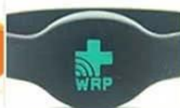
laser engraved with color