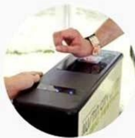
Secure access control