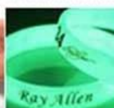
glow in dark