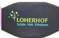
3 C silk screen printing