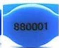
laser number with color