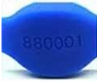
laser number no color