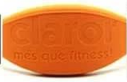
laser engraved no color