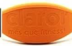
laser engraved no color