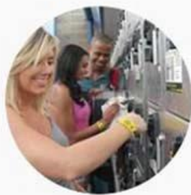
Used in SPA