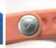
laser LOGO on lock