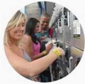
Used in SPA