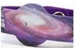
heat transfer printing