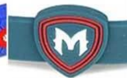
combination multi color