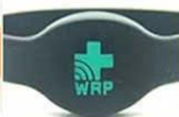
laser engraved with color