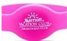
1 C silk screen printing