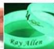
glow in dark