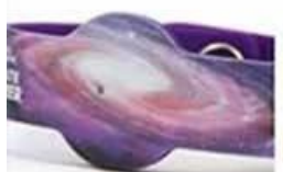
heat transfer printing