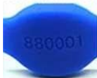
laser number no color