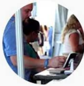
Payment for events