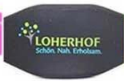
3 C silk screen printing