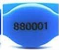
laser number with color