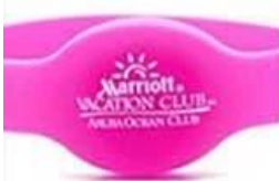
1 C silk screen printing