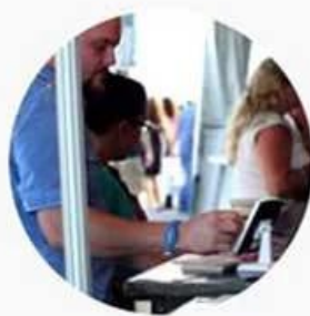
Payment for events