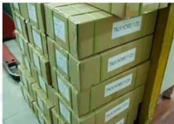
Outside Carton Package