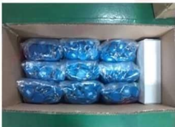
Inner Carton Package