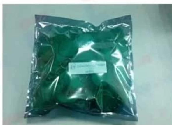
Antistatic bag (100 pcs/ bag)