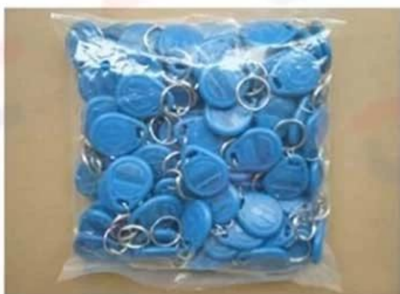
Default plastic bag (100 pcs/ bag)