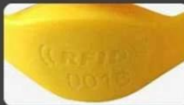
Laser UID number