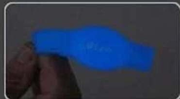
Glow in dark