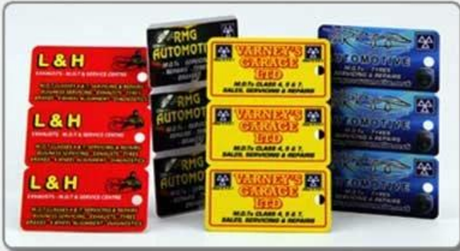
1. Comb card-style one