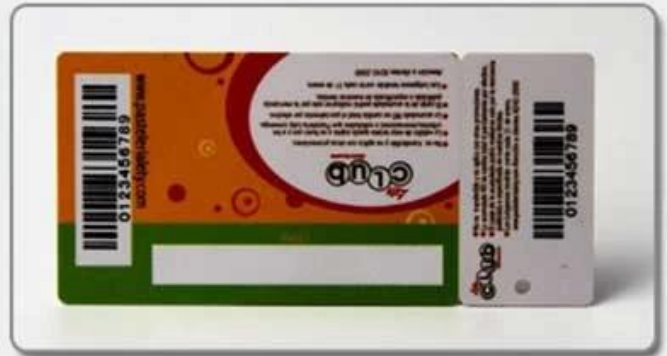
2. Comb card-style two