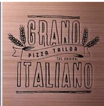
Etch with color infilling