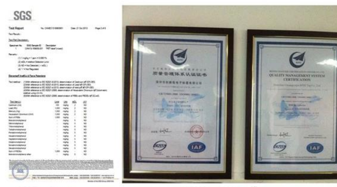
SGS Test Report