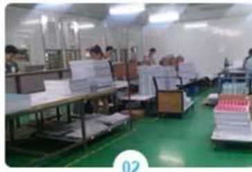
02 Laminating on machine