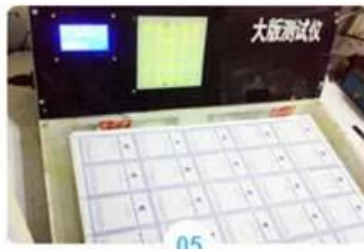
05 Pick-up whole sheet