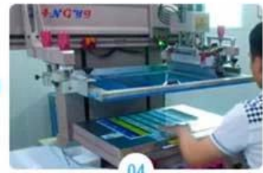
04 Silkscreen printing signature