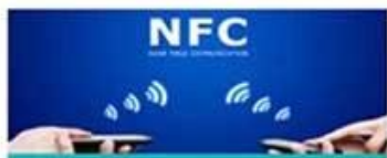
Data Exchange P2P