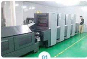
01 Heidelberg 4 color printer