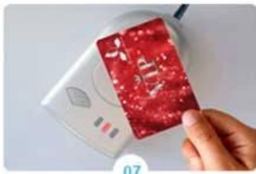
07 Pick-up cards