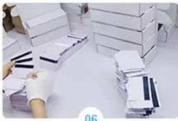
06 Pick-up cards