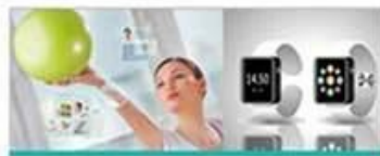
Medical & Healthcare Devices