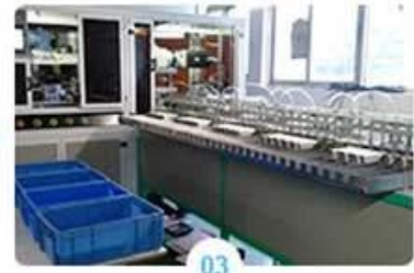
03 Automatic die-cut machine