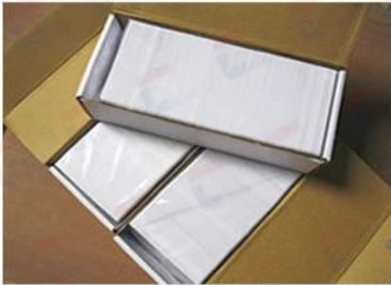
Inner Box Package