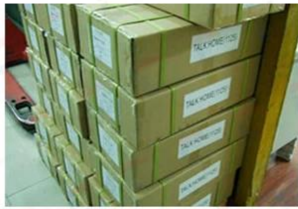
Outside Carton Package