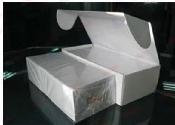
250/200 pcs Cards with Clear Paper