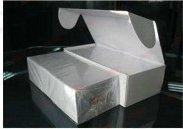
250/200 pcs Cards with Clear Paper