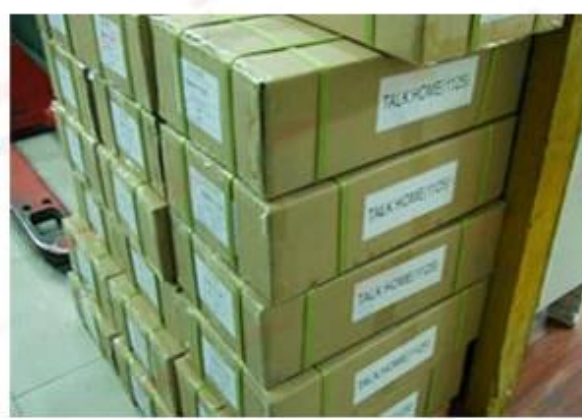
Outside Carton Package