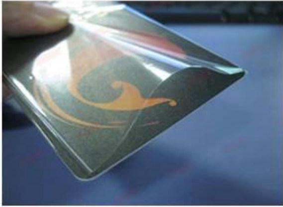
OPP Bag for Individual Card