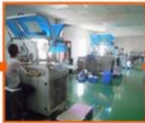
7.Punching & Diecutting