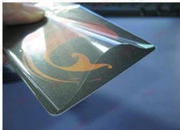
OPP Bag for Individual Card