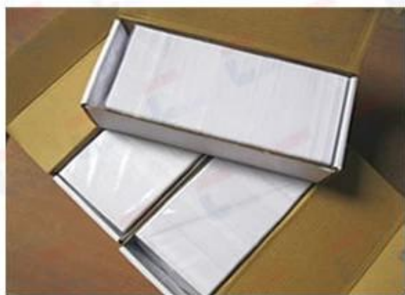
Inner Box Package