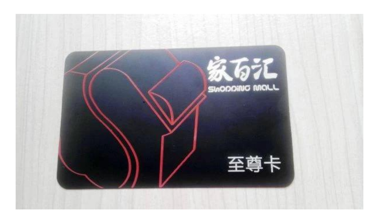
Packaging Details of Black Stainless Steel Metal Business Cards