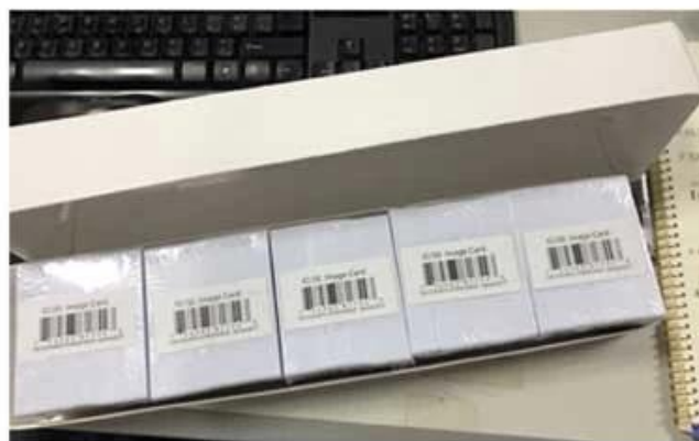
2. White Box