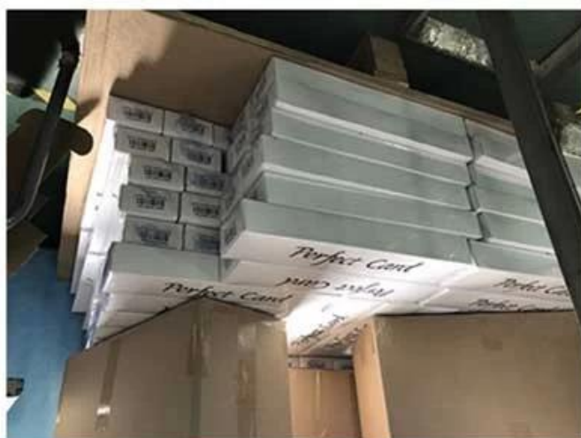
3. Outer Carton with High Quality