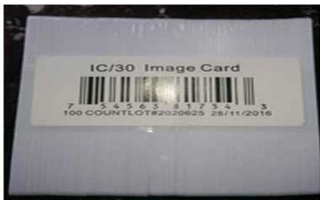
1. Hot Shrinkable film