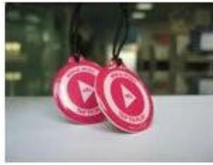
2.NFC Epoxy Tags