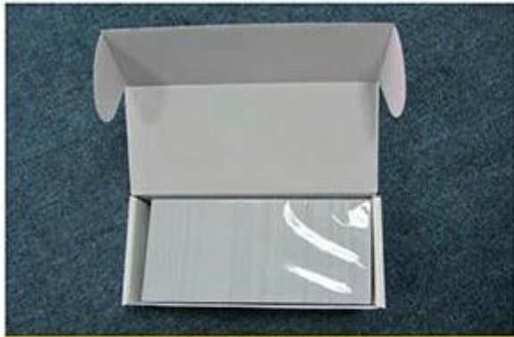
Package for Cards