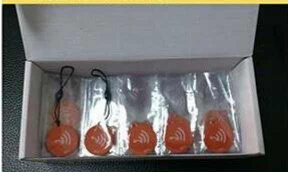
Package for Tags