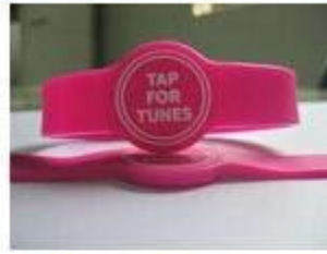
3.Silicone Wristbands (Adjustable Type )