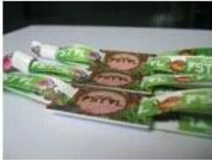
5.Woven NFC Wristbands