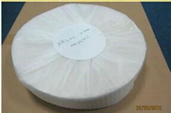
Stickers in Roll