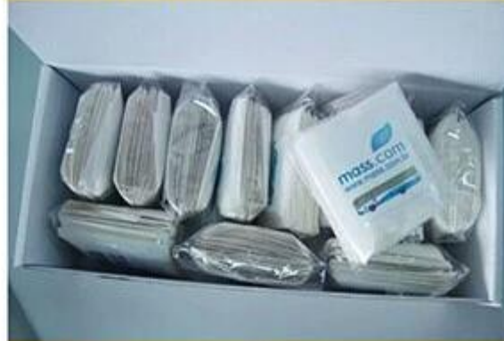
Stickers in Pieces