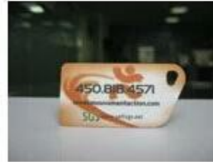
7. NFC PVC Tags