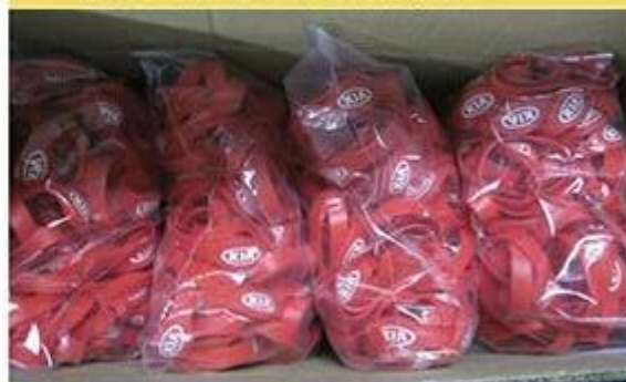
Package for Wristbands