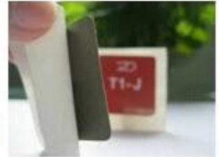
8. Anti-metal Stickers