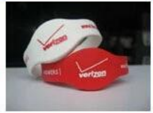
4.Silicone Wristbands (Full Sealed Type)