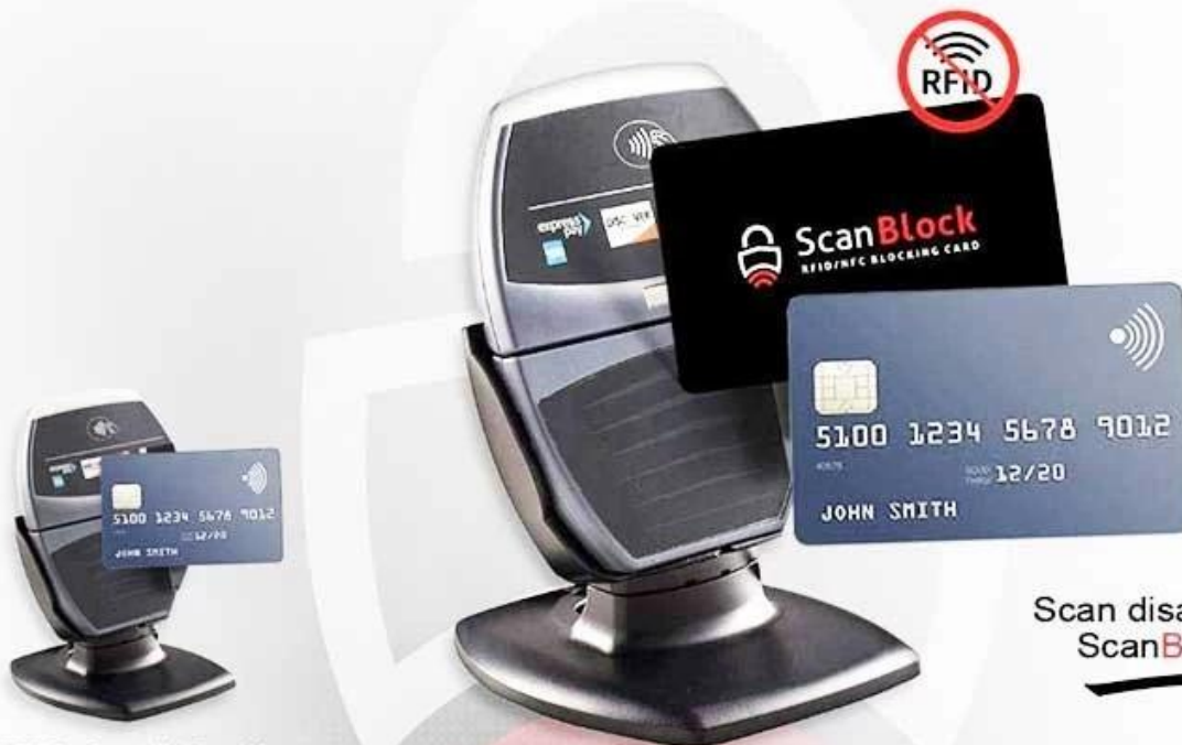
RFID Credit/Debit card scanned