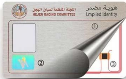
H. ① Pearlescent Color ② Anti-fake label ③ RFID Chip